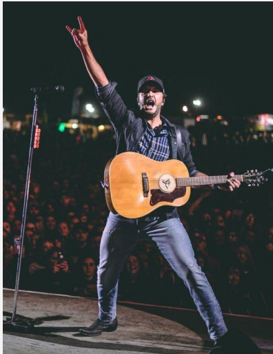
Left: Luke Bryan wearing cowboy boots.